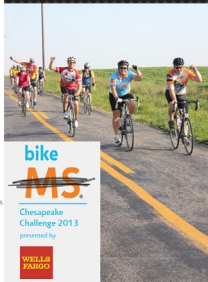
15,000 Event Brochures

BIKE MS: Chesapeake Challenge 2013 JUNE 1 - 2, 2013 » 2 DAYS » 30 - 150 MILES BIKEMS.MARYLAND.ORG 443.641.1200