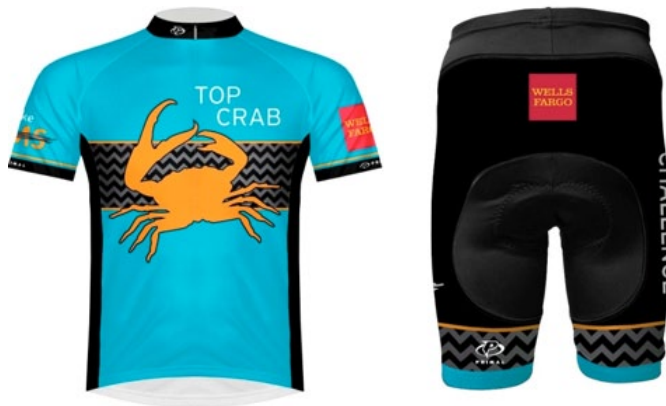
Top Crab Jersey and Shorts