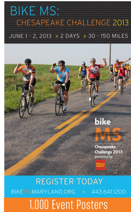
1,000 Event Posters