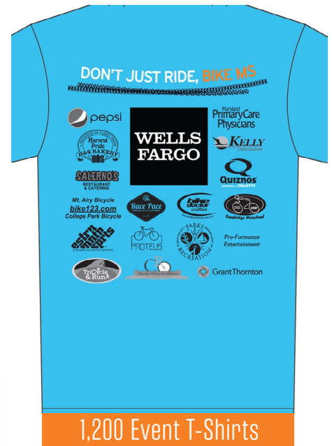
1,200 Event T-Shirts